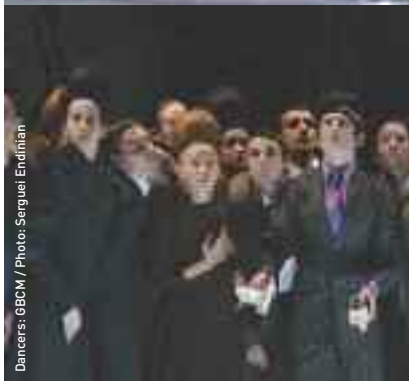
Dancers: OBCM