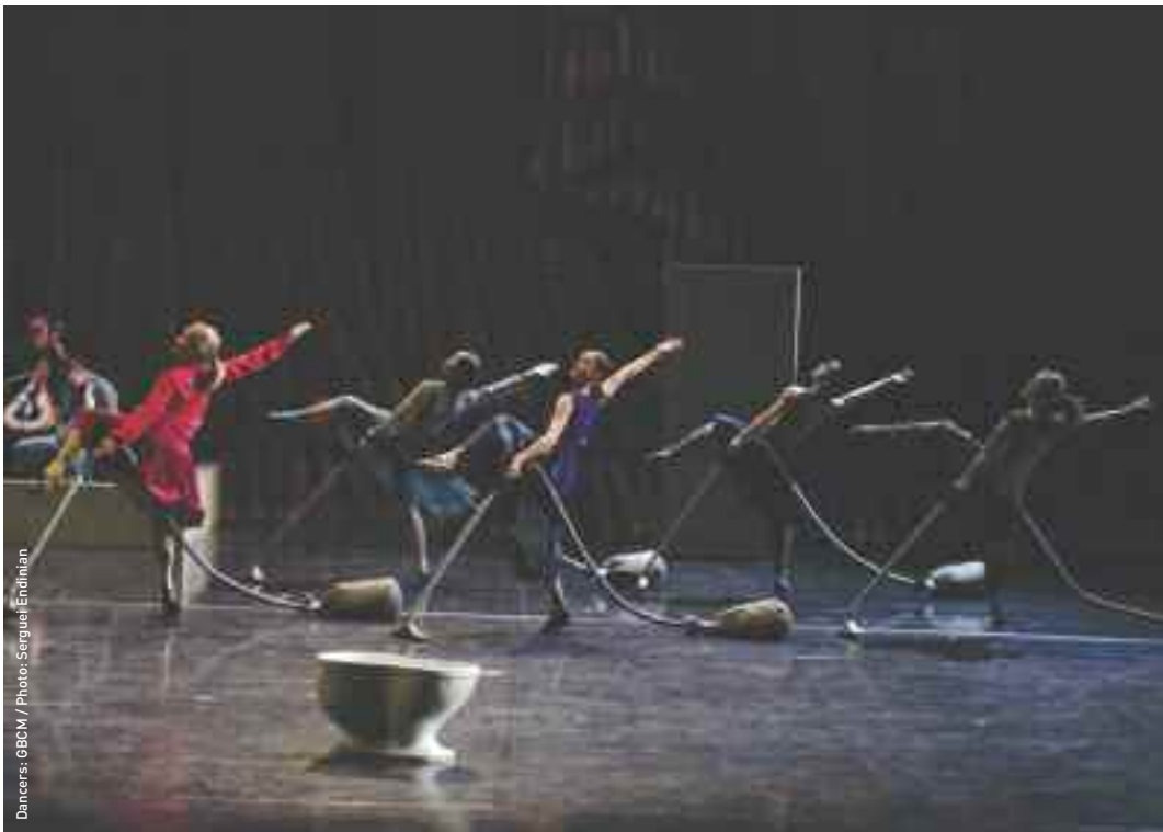
Dancers: GBCM / Photo: Serguei Erdimian