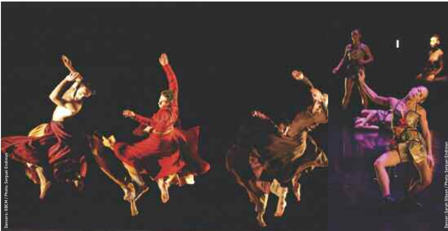
Dancers: GBCM