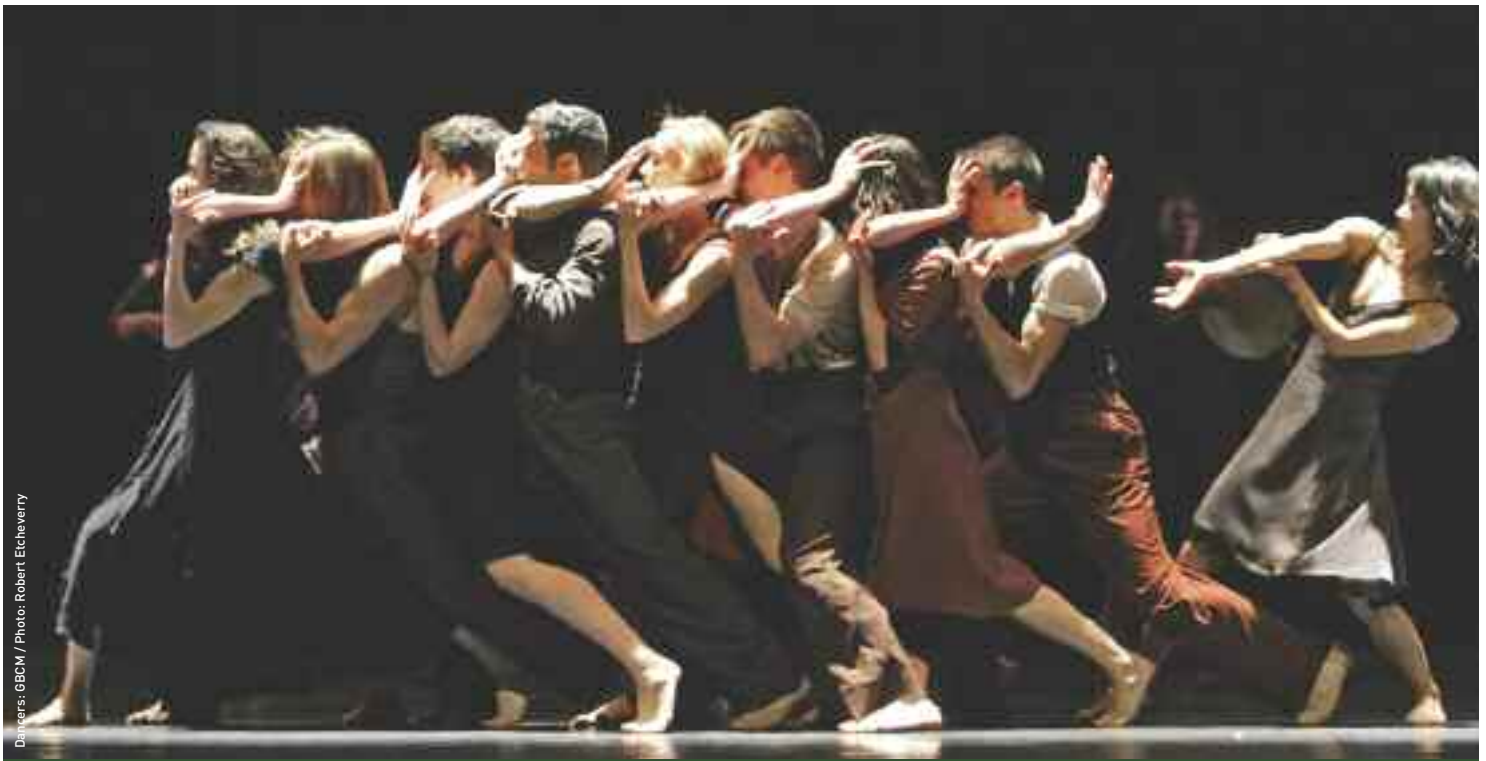
Dancers: GBCM