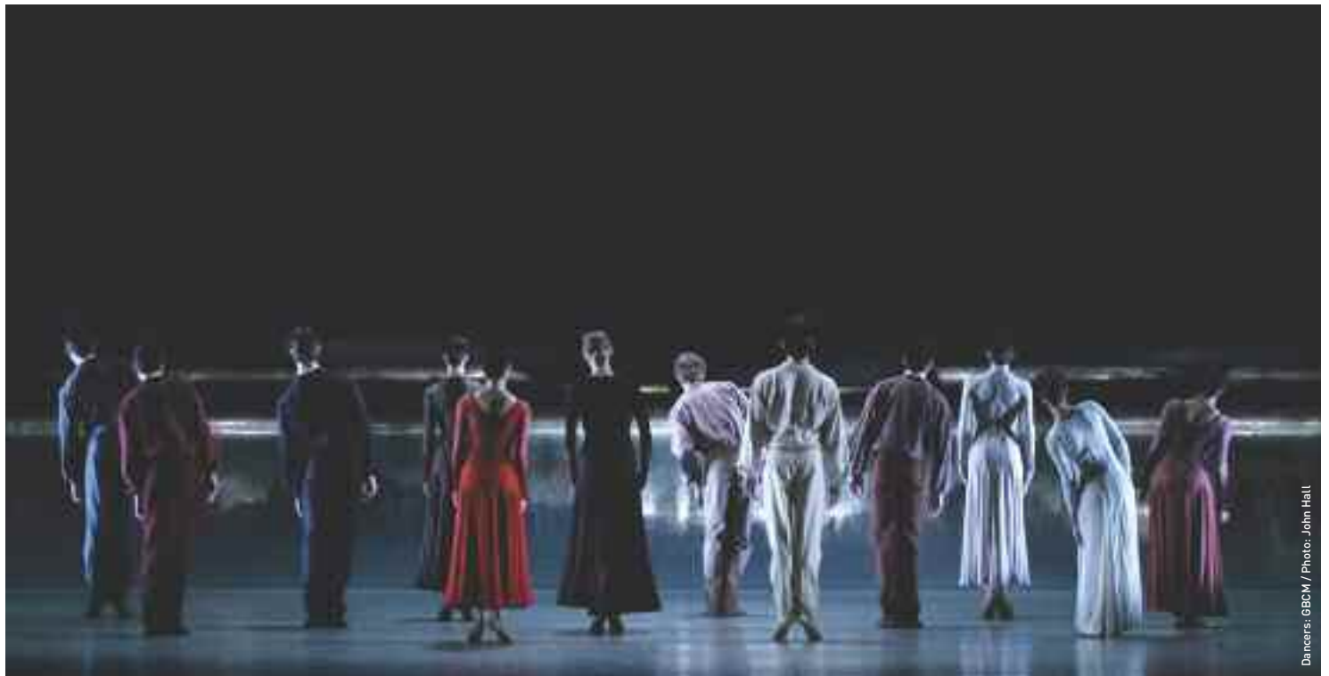
Dancers: GBCM