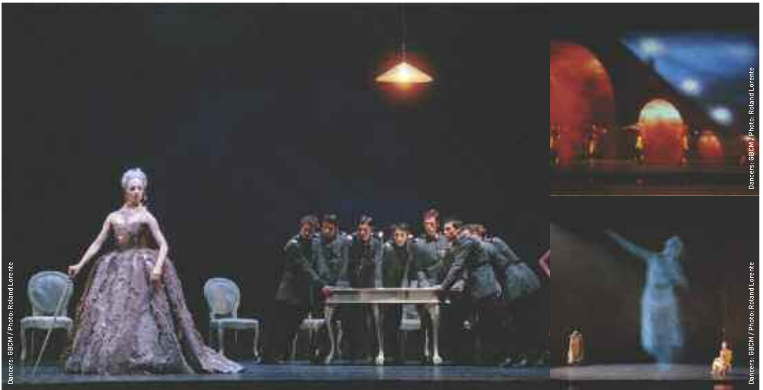
Dancers: GBCM