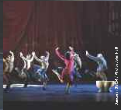
Dancers: GBCM